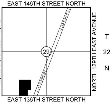
Exhibit of Vacation Plats

of BLOCKS 8, 9, & 16, SOUTHPARK ADDITION AND LOTS 1-12 AND LOTS 19-36, BLOCK 4, SANTA FE ADDITION SECTION 29, TOWNSHIP 22 NORTH, RANGE 14 EAST, CITY OF COLLINSVILLE, TULSA COUNTY, OKLAHOMA